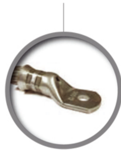
HEXAGONAL CRIMPING 50 > 630 mm 2