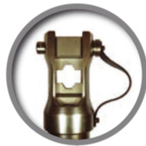
Die sets 50 > 630 mm 2